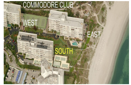
Built in 1974 - 181 units - 12 floors

Commodore Club South Condominium (305) 361-7214 & (305) 361-5261