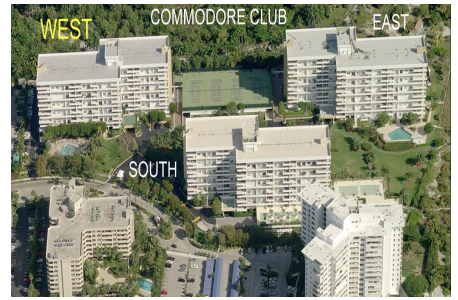
Built in 1973 - 186 units - 12 floors

Commodore Club West Association Inc (305) 361-7316