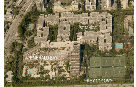
Built in 1980 - 285 units - 12 floors

Key Colony Condominium Association - Emerald Bay Manager Office (305) 361-6947 info@theemeraldbay.com http://theemeraldbay.com/?page_id=12