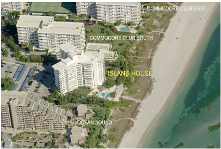
Built in 1961 - 118 units - 14 floors

Island House Apartment Inc (305) 361-5451