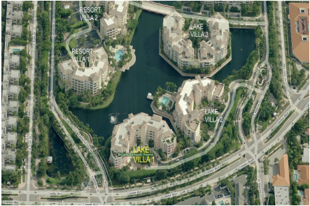
Built in 2002 - 38 units - 6 floors

Lake Villa One Condominium Association Inc 721 Crandon Blvd Key Biscayne 33149 (305) 361-1359 (305)-361-8972 http://www.oceanclubkeybiscayne.org/Default.aspx?p=DynamicModule&pageid=301066&s