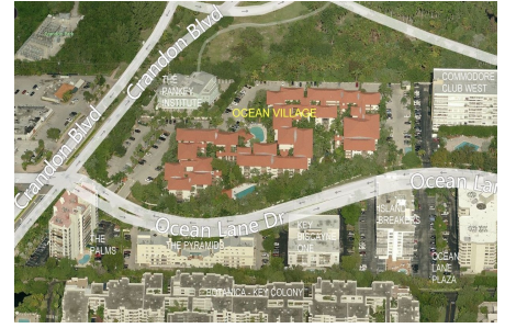
Built in 1982 - 140 units - 4 floors

Ocean Village Condominium Association Inc, 101 Ocean Lane Drive Key Biscayne, FL 33149 Phone: (305) 361-3416