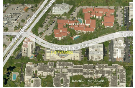
Built in 1991 - 30 units - 6 floors

THE PYRAMIDS AT KEY BISCAYNE CONDOMINIUM ASSOCIATION, INC. 260 CRANDON BLVD # 55 KEY BISCAYNE FL 33149 PHONE 305-361-3262 FAX 305-361-5789