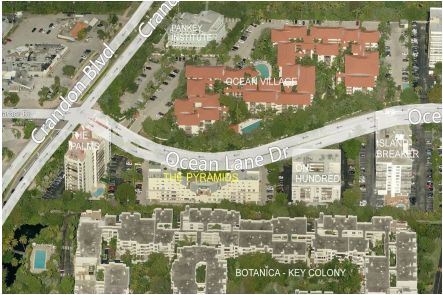
Built in 1991 - 30 units - 6 floors

THE PYRAMIDS AT KEY BISCAYNE CONDOMINIUM ASSOCIATION, INC. 260 CRANDON BLVD # 55 KEY BISCAYNE FL 33149 PHONE 305-361-3262 FAX 305-361-5789