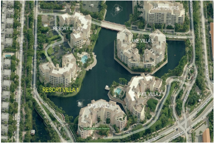
Built in 1998 - 46 units - 6 floors

Ocean Club Community Association, Inc 753 Crandon Blvd Key Biscayne FL33149 (305) 361-3361 (305)-365-6085 http://www.oceanclubkeybiscayne.org/Default.aspx?p=DynamicModule&pageid=301066&s