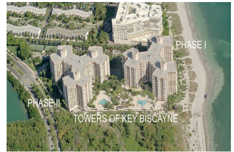
Built in 1972 - 262 units (538 with phase 2)- 16 floors

The Towers of Key Biscayne Condominium Association (305) 361-9114 http://www.tkbonline.com/contact-us