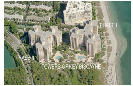
Built in 1972 - 262 units (538 with phase 2)- 16 floors

The Towers of Key Biscayne Condominium Association (305) 361-9114 http://www.tkbonline.com/contact-us