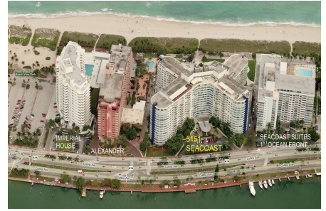
Built in 1966 - 441 units - 17 floors

Seacoast 5151 Condo Association, Inc 305-865-0484 manager@seacoast5151.com http://www.seacoast5151.com