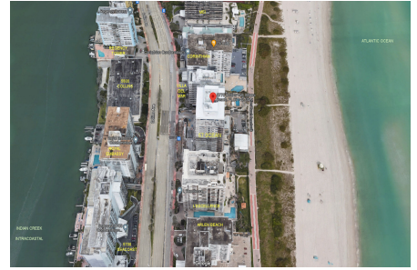
Built in 2021 - 69 units - 19 floors

57 Ocean Condominium Association, Inc. 5775 Collins Ave Miami Beach, FL33140 https://www.57ocean.com/