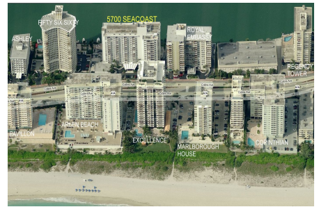
Built in 1968 - 177 units - 16 floors

Seacoast 5700 Condominium Association Inc 305-866-9120 & 305-866-9651