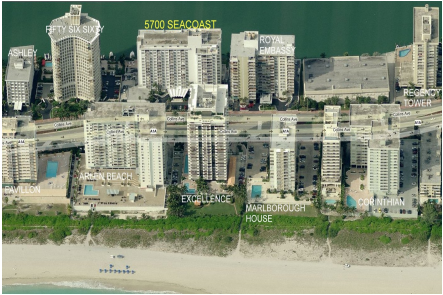
Built in 1968 - 177 units - 16 floors

Seacoast 5700 Condominium Association Inc 305-866-9120 & 305-866-9651