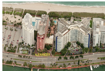
Built in 1962 - 230 units - 17 floors

The Alexander Condo Association 305-861-4083 TheAlex@The-Beach.net http://www.alexandercondo.com