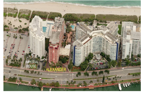
Built in 1962 - 230 units - 17 floors

The Alexander Condo Association 305-861-4083 TheAlex@The-Beach.net http://www.alexandercondo.com