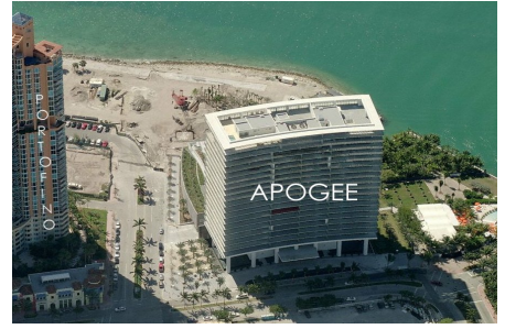
Built in 2008 - 67 units - 23 floors

Apogee Condominium Association Inc 305-674-1163. http://www.apogeecondomiami.com/