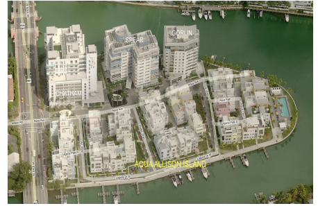
Built in 2005 - 46 units - 4 floors

Sub-association - Aqua Island Homes Association aquaassistant@aquaassociation.net http://www.aqua.net/index.php