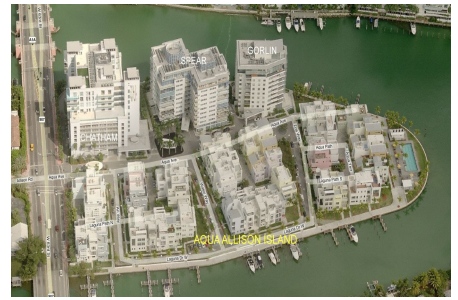
Built in 2005 - 46 units - 4 floors