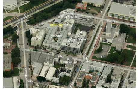
Built in 2011 - 55 units - 6 floors

Artepark North Condominium Association, Inc 435 21st Street Suite #2 Miami Beach 33139