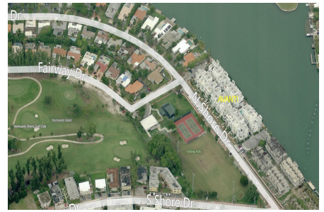
Built in 2006 - 32 units - 4 floors