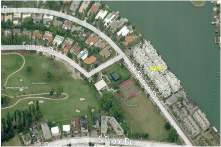
Built in 2006 - 32 units - 4 floors