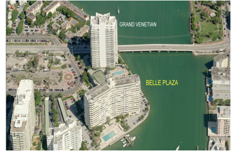
Built in 1962 - 226 units - 15 floors

Belle Plaza Condominium Association, inc (305) 538-7221 http://www.belleplaza.org/index.html