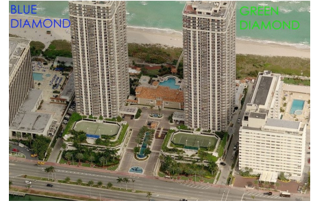
Built in 2000 - 315 units - 44 floors

Blue Diamond condominium Association, inc (305) 672-9910 & 305-672-4779 http://bluegreendiamondcondos.com/blue