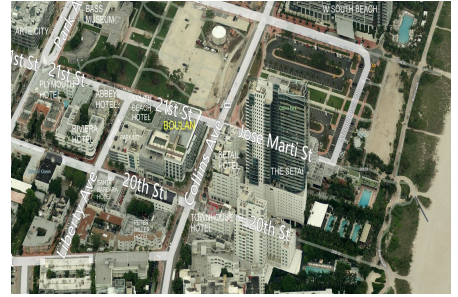
Built in 2011 - 52 units - 6 floors

Boulan South Beach 2000 Collins Avenue Miami Beach, FL 33139 inquiries: 305.674.3315 Email: frontdesk@boulansouthbeach.com http://www.boulanmiami.com/default-en.html