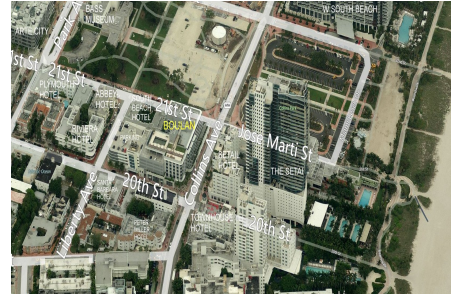
Built in 2011 - 52 units - 6 floors

Boulan South Beach 2000 Collins Avenue Miami Beach, FL 33139 inquiries: 305.674.3315 Email: frontdesk@boulansouthbeach.com http://www.boulanmiami.com/default-en.html