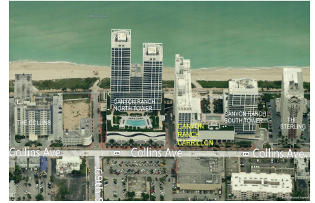
Built in 2008 - 230 units - 16 floors

Canyon Ranch Living Miami Beach Condo Association Management Office 6801 Collins Ave Miami Beach FL 33140 305-514 7000