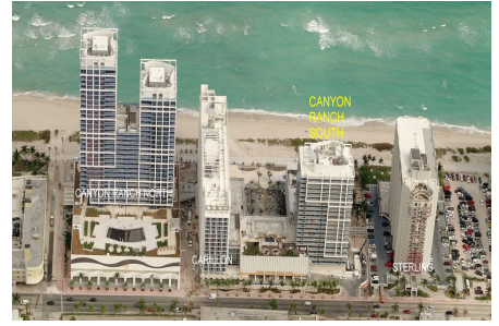
Built in 2007 - 143 units - 20 floors

Ranch Canyon 6799 Collins Ave, Miami Beach, FL 33141 (786) 220-7093