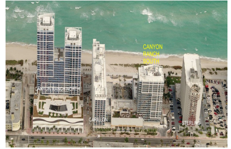
Built in 2007 - 143 units - 20 floors

Ranch Canyon 6799 Collins Ave, Miami Beach, FL 33141 (786) 220-7093