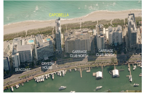
Built in 1995 - 79 units - 24 floors

Capobella Condominium Assn Inc (305) 861-8714