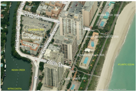
Built in 1998 - 48 units 5 floors

Capomar Condominium Association Inc 275 Fontainebleau Boulevard # 200 Miami, FL 33172 - Phone: (305) 672-2792