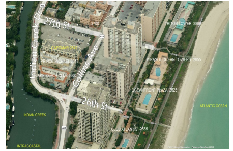
Built in 1998 - 48 units 5 floors

Capomar Condominium Association Inc 275 Fontainebleau Boulevard # 200 Miami, FL 33172 - Phone: (305) 672-2792