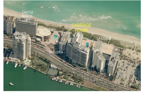
Built in 1967 - 385 units - 17 floors

Number of units: 385 Number of active listings for rent: 8 Number of active listings for sale: 21 Building inventory for sale: 5% Number of sales over the last 12 months: 14 Number of sales over the last 6 months: 9 Number of sales over the last 3 months: 4