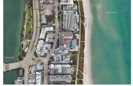
Built in 1948 - 285 units - 10 floors

THE CASABLANCA ON THE OCEAN 6345 Collins Ave, Miami Beach, FL 33141, +1 305-868-0010