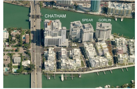
Built in 2004 - 16 units - 11 floors

Continental Group Inc Management Co 305-864-0199 Aqua Allison Island Associations aquaadmin@aquaassociation.net Sub-association - Chatham @ Aqua Condominium Association Inc aquaassistant@aquaassociation.net