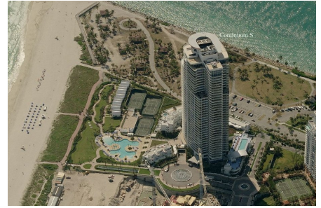
Built in 2002 - 308 units - 40 floors

Continuum South Tower Condo association (305) 938-4240