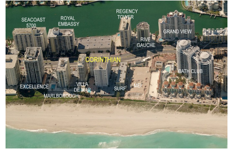
Built in 1967 - 138 units - 15 floors