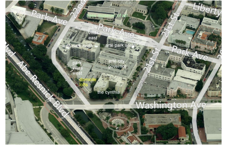
Built in 1948 - 17 units - 2 floors

Number of units: 17 Number of active listings for rent: 0 Number of active listings for sale: 0 Building inventory for sale: Number of sales over the last 12 months: 0% Number of sales over the last 6 months: 1 Number of sales over the last 3 months: 1