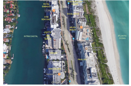
Built in 1970 - 90 units - 22 floors

Fifty Six Sixty Collins Ave Condominium, Inc 5660 Collins Avenue Miami Beach, FL 33140 Phone: (305) 866-3411