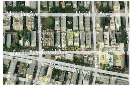
Built in 2007 - 33 units - 3 floors

The Fountain Condo Hotel 334 Euclid Ave Miami Beach, FL 33139 (305) 538-6140