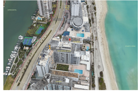
Built in 1962 - 42 units - 8 floors

Galeria Condominiums Address: 5415 Collins Ave, Miami Beach, FL 33140, Phone: +1 305-864-1360