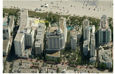
Built in 1980 - 146 units - 10 floors

Georgian Condominium Association (305) 672-6839