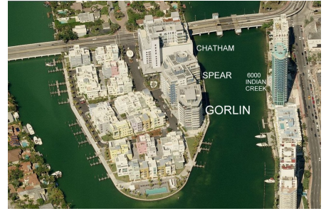
Built in 2005 - 29 units - 11 floors

Continental Group Inc Management Co 305-864-0199 Aqua Allison Island Associations aquaadmin@aquaassociation.net Sub-association - Gorlin @ Aqua condominium association Inc aquaassistant@aquaassociation.net