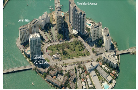
Built in 2001 - 124 units - 25 floors

Grand Venetian Condominium Association (305) 672-0966