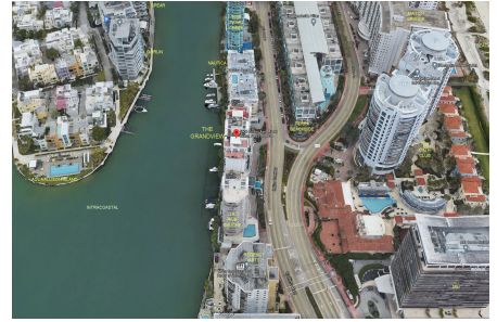
Built in 1998 - 122 units - 23 floors