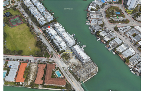
Built in 2015/2020 - 40 units - 4 floors

Number of units: 40 Number of active listings for rent: 1 Number of active listings for sale: 0 Building inventory for sale: Number of sales over the last 12 months: 0% Number of sales over the last 6 months: 0 Number of sales over the last 3 months: 0