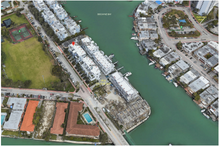
Built in 2015/2020 - 40 units - 4 floors

Iris On the Bay Address: 81 N Shore Dr, Miami Beach, FL 33141, U Phone: +1 786-520-2271 http://www.miamiprimemanagement.com/property/iris-on-the-bay-management.htm