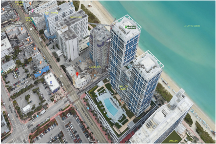
Built in 2019 - 25 units - 17 floors

L'Atelier Condominium Address: 6901 Collins Ave, Miami Beach, FL 33141 Phone: +1 786-204-3508 https://lateliermiamibeach.com/#home/overview