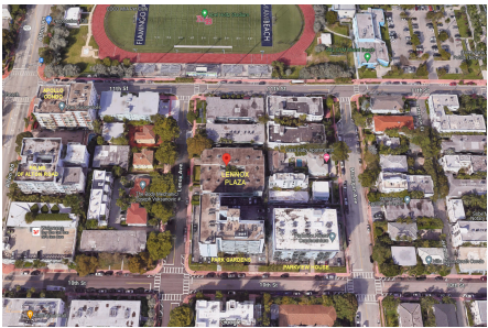
Built in 1977 - 28 units - 3 floors