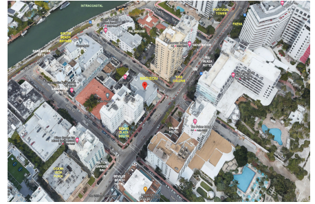
Built in 1941 - 32 units - 4 floors