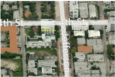
Built in 2004 - 6 units - 5 floors