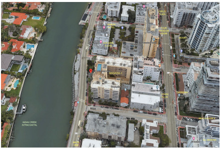
Built in 1999 - 59 units - 7 floors

Masada II Condo Corporation Address: 3737 Indian Creek Dr, Miami Beach, FL 33140 Phone: +1 305-534-1515