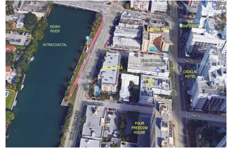
Built in 1992 - 35 units - 5 floors

Masada Condominium Association Inc 3901 Indian Creek Drive 518 Miami Beach, FL 33140 (305) 534-1515