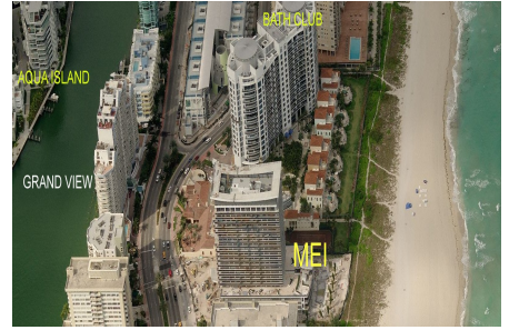
Built in 2008 - 134 units - 21 floors