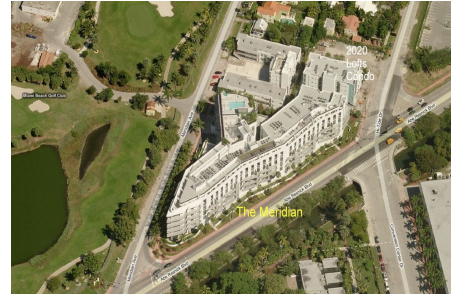
Built in 2001 - 111 units - 6 floors

Meridian Condominium Association (305) 673-9470