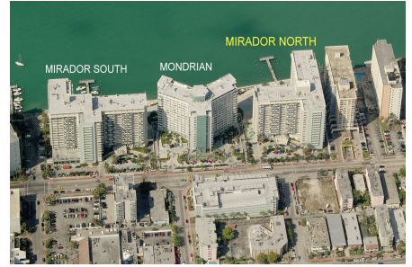
Built in 1965 - 411 units - 16 floors

Mirador 1200 Condominium Association, Inc. 305.532.7545