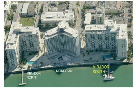
Built in 1968/2004 - 447 units - 16 floors

Mirador 1000 condominium association inc 305.672.8353 & Coordinator@Mirador1000.com http://www.mirador1000.com/content/contact