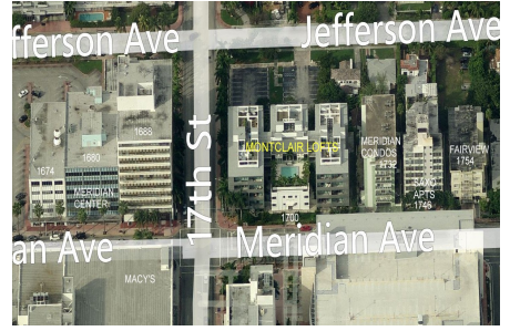
Built in 2005 - 41 units - 6 floors