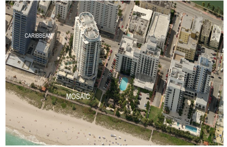
Built in 2006 - 90 units - 20 floors

Mosaic On Miami Beach Condo Association 305-674-8889